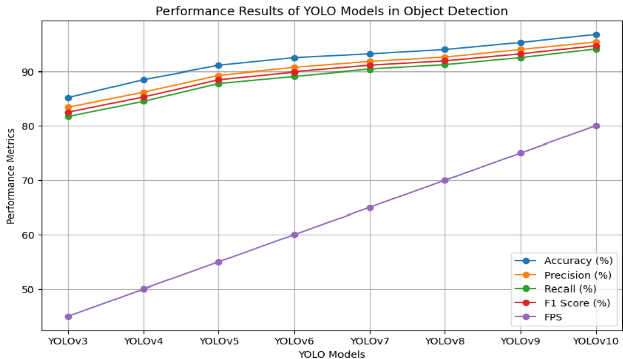
Figure 2: Accuracy comparison of YOLOv10 with previous YOLO versions.